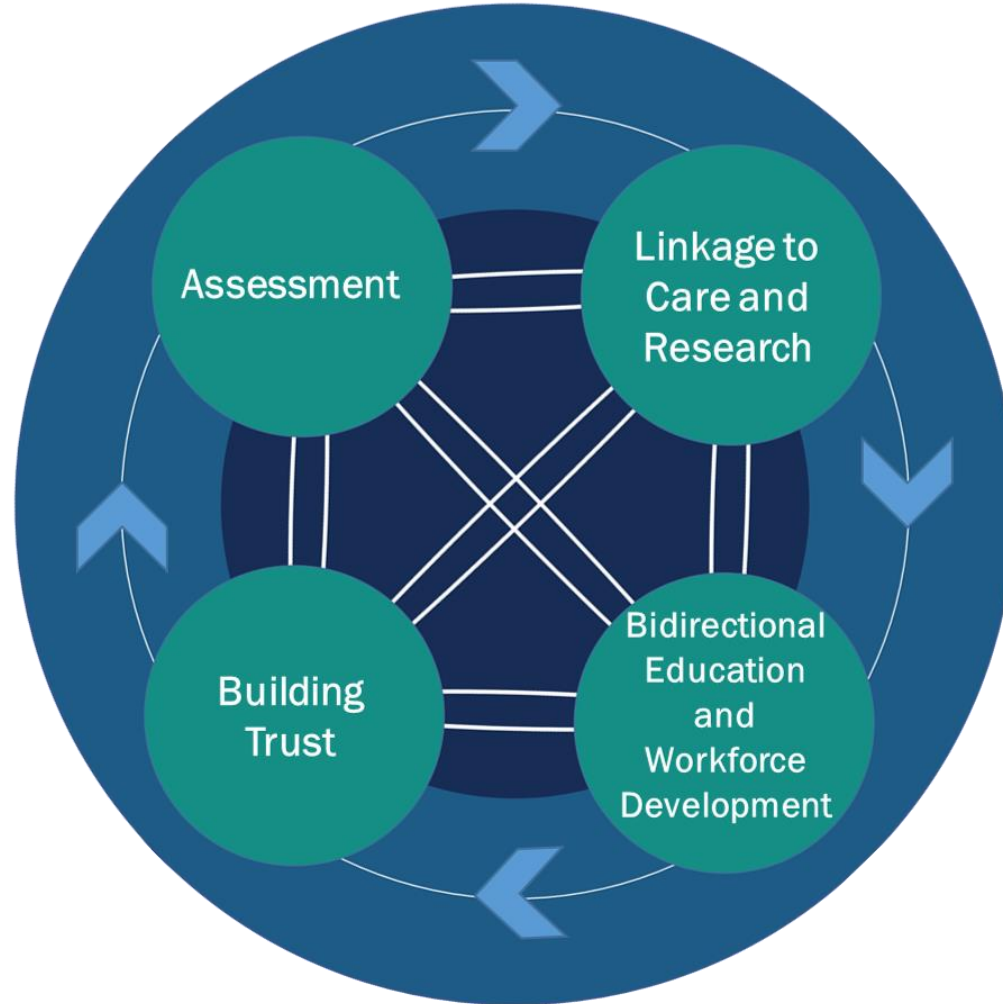
Figure 2: HealthStreet's four pillars

Data in this report is stratified by the year of intake of the community members. UF HealthStreet is operational since October 2011, and has members from 54 out of 67 counties in the state of Florida. Figure 1 shows the members from different counties recruited into HealthStreet program from October 2011- June 2020.